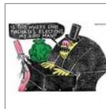
Buying The Election