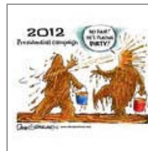
Dirty 2012 campaign